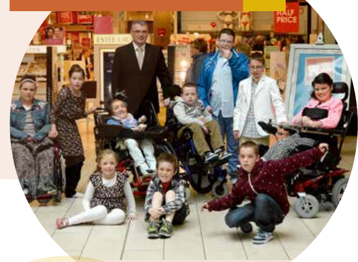
Children from the Kerry After Schools Club who organised the annual fashion show in Manor West Retail Park

We supported children at every stage of their development cycle from newborn to preschool, primary and post primary. Our goal is to support each child in reaching their potential and to maximise their inclusion and independence.