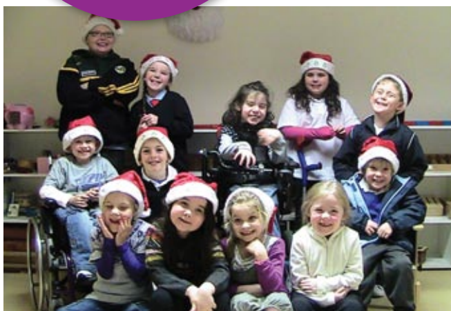
The Club Chaos Team get set for Christmas