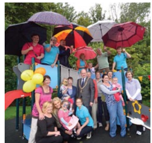
Kilkenny Services playground official opening

Donations of clothes, shoes, books, accessories and bric-a-brac can now be made at the Children's Service Centre in Bray