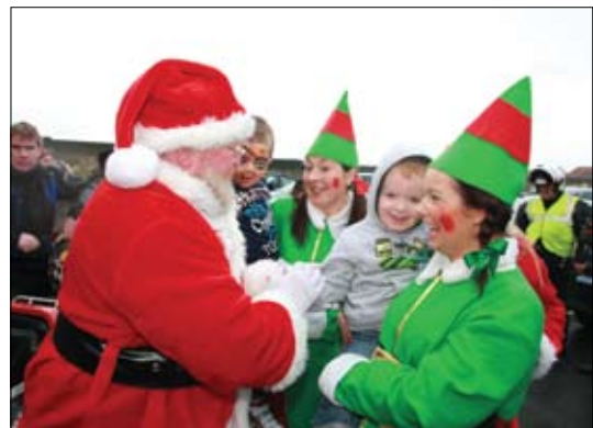
Santa and his elves came to the Enable Ireland Limerick Children's Services Christmas Party on Harley Davidsons thanks to the Mid West Bikers for Charity.