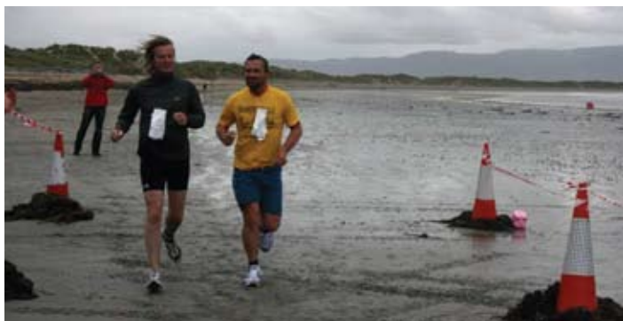
Participants in the first annual Kerry Head Triathlon in aid of Enable Ireland Kerry which took place on 5 September.