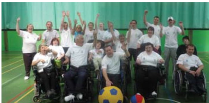
Dun Laoghaire Adult Services Sports Week took place in July in Loughlinstown Leisure Centre.