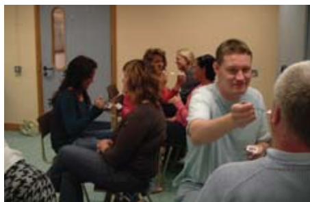
Participants take part in practical training at the Eating, Drinking and Swallowing Training in Sandymount Services

Further training will be available in relation to individual children with more complex needs. Due to the success of this training, the EDS team hopes to run similar follow up sessions in the future.