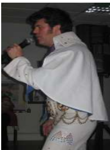
The king was back in town!