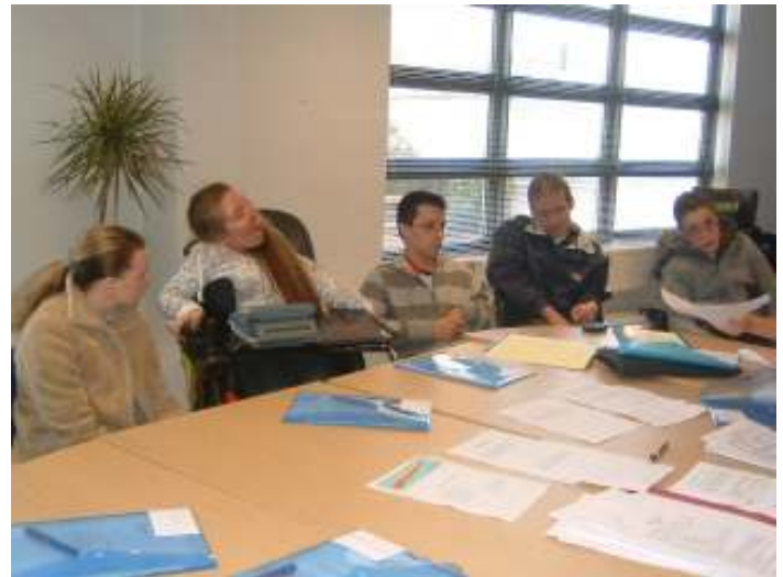
Several team members busy at work!

This is going to give us a voice. A possibility to let everybody know who we are and what we like to do.