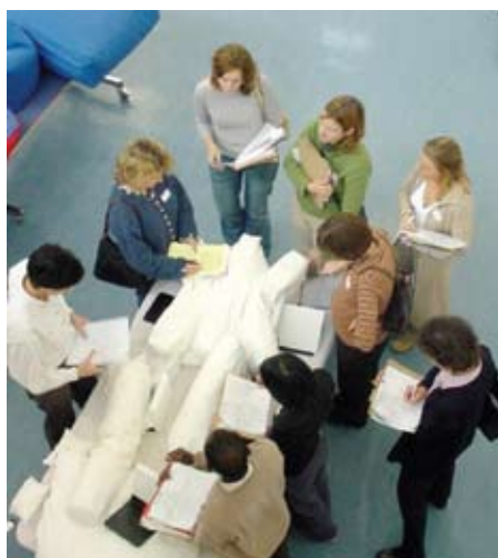
Comparing notes on a night positioning system at an ERPM Equipment Evaluation day